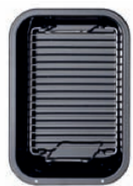
Roasting tin & grill rack

Roasting Oven Cast-iron ovens for radiant heat means food is cooked naturally, keeps its succulence and is full of flavour. (Shown with grid shelf.)