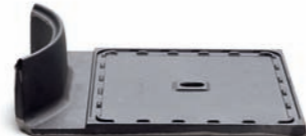
Heat Conducting Plates

Direct heat from the barrel to other areas of the AGA. The heat conducting plate from the barrel to below the roasting oven means the oven floor is wonderfully hot for authentic pizzas, moreover apple pies have a crisp browned base, even in a ceramic dish.