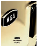
The AGA Book