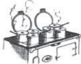
When you need heat

When you start cooking, the thermostat opens automatically to increase the draught; when you stop using the Aga, the thermostat closes and the fire slumbers.